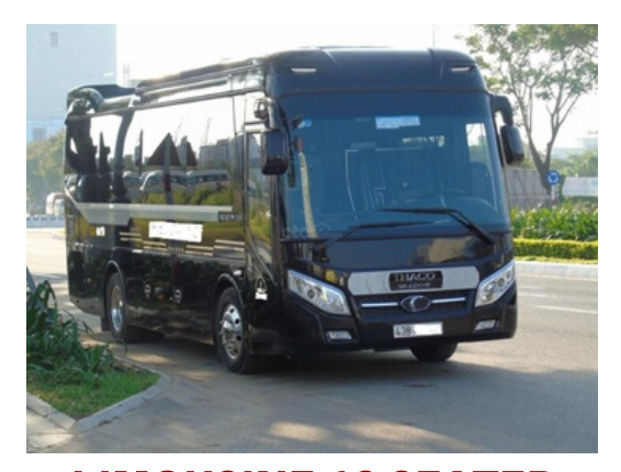
LIMOUSINE 19 SEATER