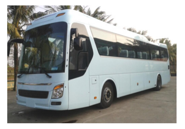
45 SEATER COACH