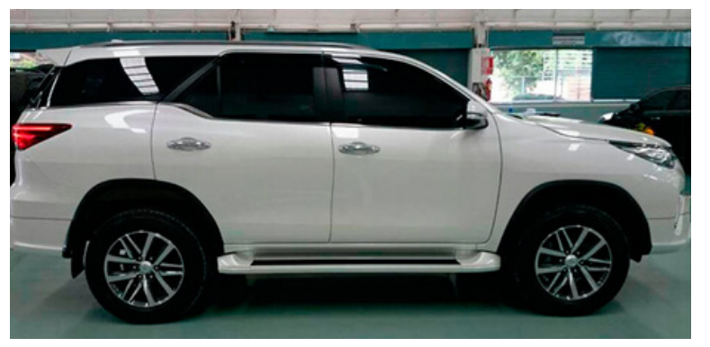
07 SEATER CAR