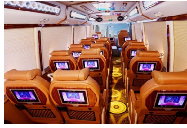
INSIDE LIMOUSINE 19 SEATER