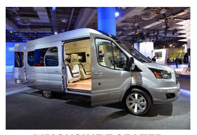
LIMOUSINE 7 SEATER