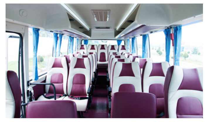
INSIDE 29 SEATER COACH