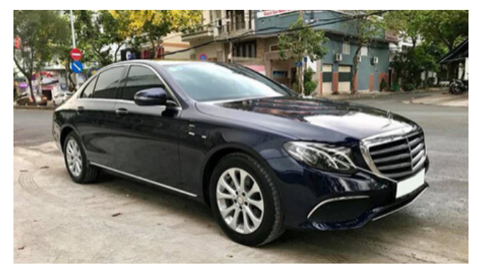
04 SEATER CAR